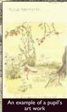
An example of a pupil's art work