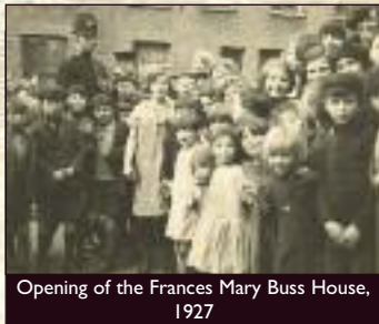
Opening of the Frances Mary Buss House, 1927