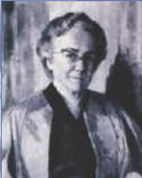
Dame Helen Gardner