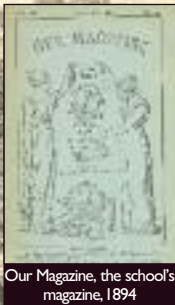
Our Magazine, the school's magazine, 1894