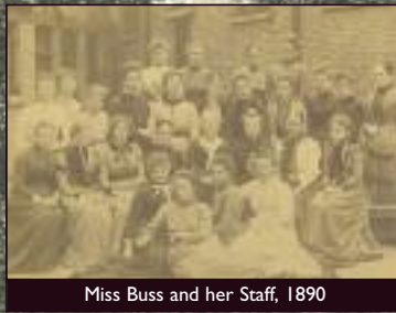
Miss Buss and her Staff, 1890