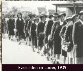
Evacuation to Luton, 1939