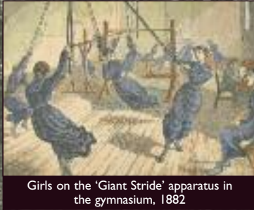
Girls on the 'Giant Stride' apparatus in the gymnasium, 1882