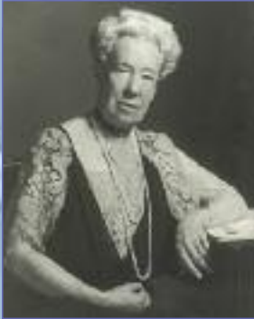
Dame Elizabeth Cadbury