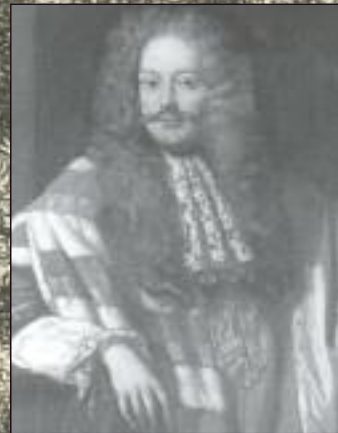
James Brydges, first Duke of Chandos