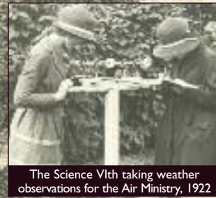
The Science Vith taking weather observations for the Air Ministry, 1922