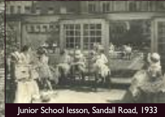
Junior School lesson, Sandall Road, 1933