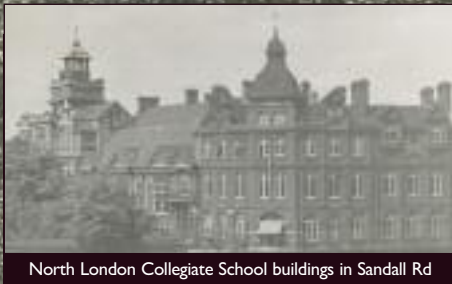
North London Collegiate School buildings in Sandall Rd