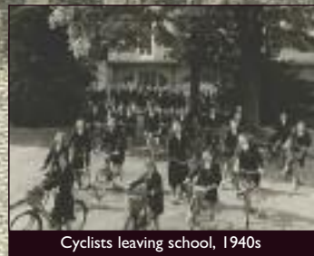
Cyclists leaving school, 1940s