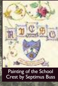
Painting of the School Crest by Septimus Buss